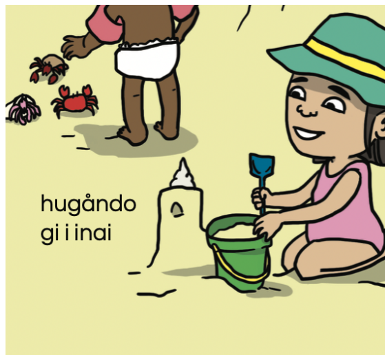
hugando gi i inai